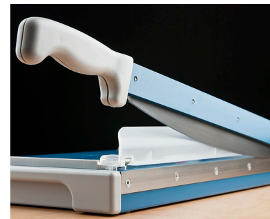
The ground, self-sharpening cutting blade produces a clean, burr free cut.