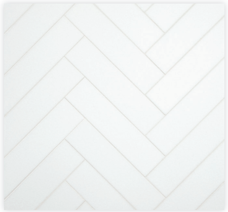
12" x 12" Board

Born from the latest glass production technology, ThassoGlass is the most durable pure white tile & mosaic material available today. It is made of natural materials, similar to common glass, however with the addition of some minerals and modern processing, a super glass is born.