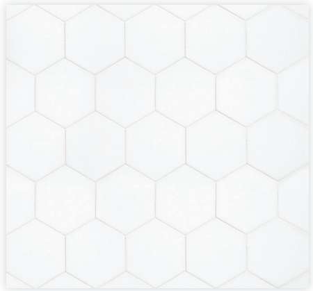
12" x 12" Board

BRD-TG1-EG2-103 1-1/2" x 6" Herringbone ThassoGlass (P)