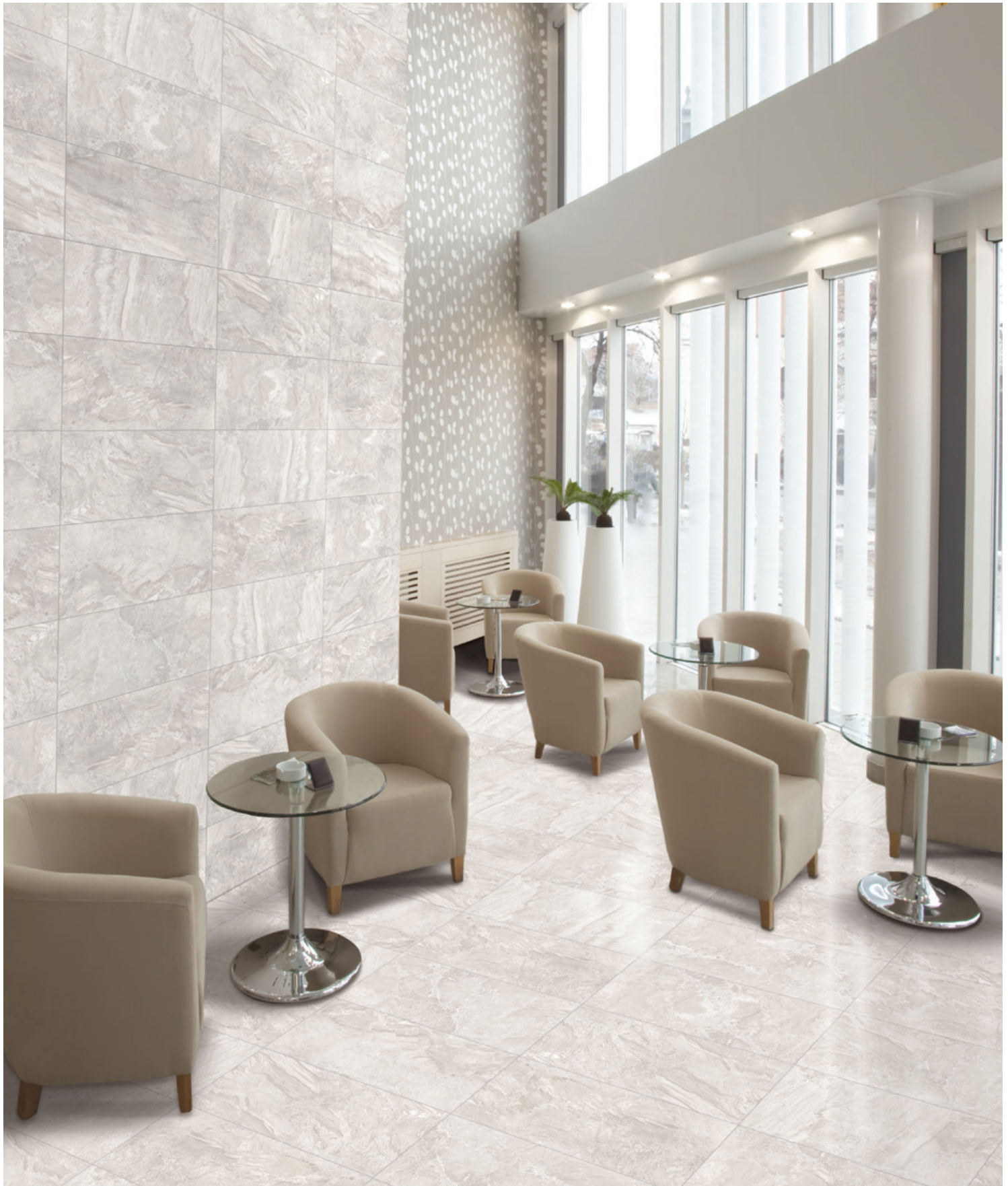
Floor 12"x24" ♦ Wall 11.54"x23.19" Rectified, Semi-Polished Ω†∞