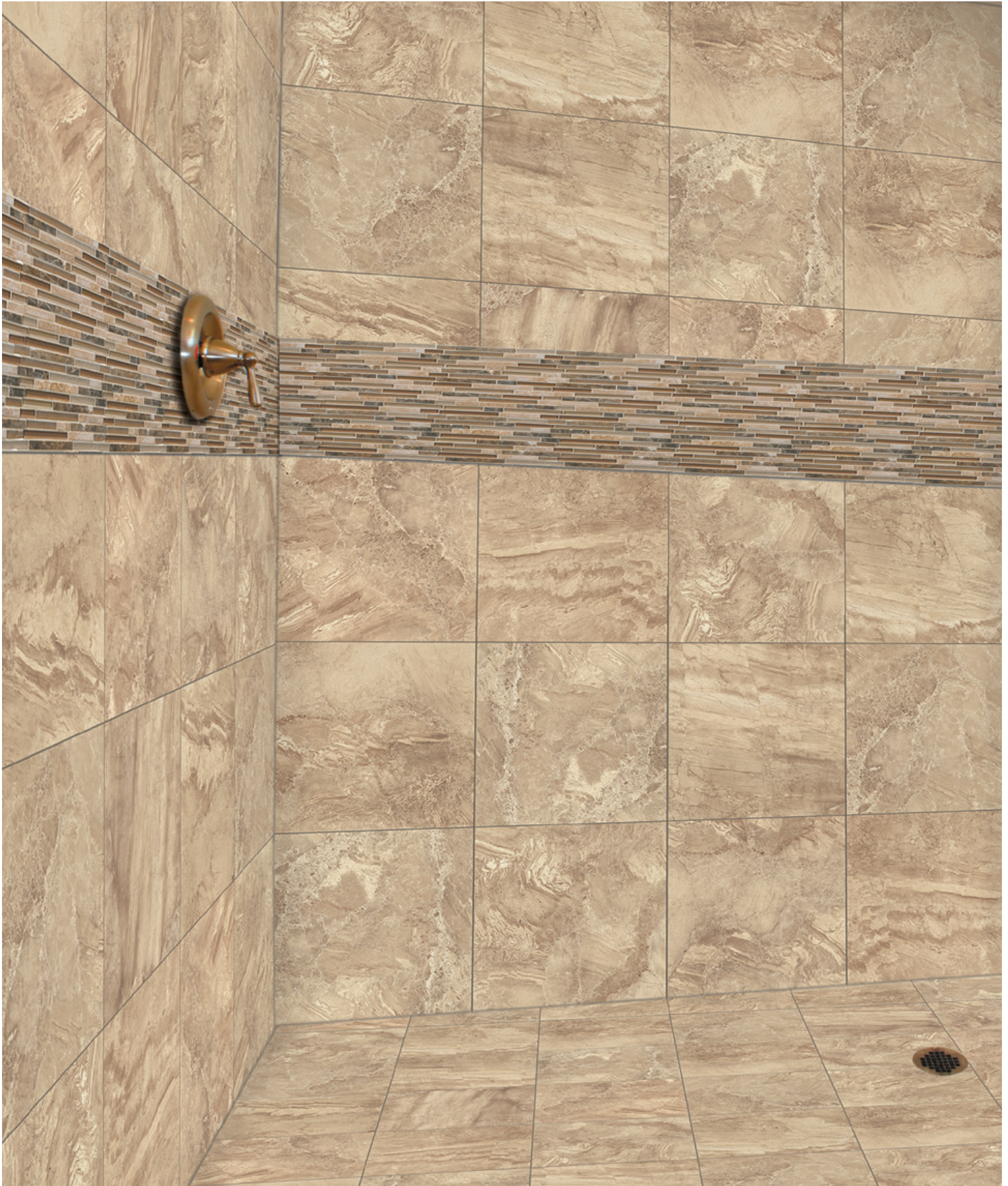
Floor 12"x12" • Wall 17.36"x17.36" Rectified, Semi-Polished \Omega^{\dagger\infty} Iced Rocks, Espresso Stone Blend