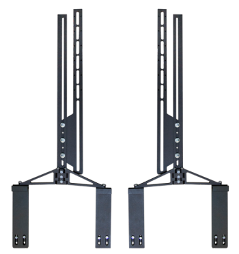
Part A (Pre-Assembled) (2) VESA rails, (2) Bracket rails, (2) Long swivel joints (part B)

Installation guide for James Loudspeakers SPL6 SoundBar universal mounting bracket.