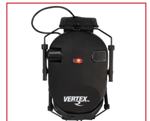
Dynamic Range Speakers