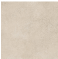
Beige VTL PLBE