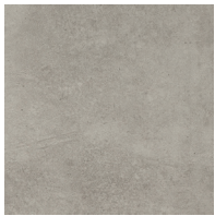
Light Gray VTL PLLG