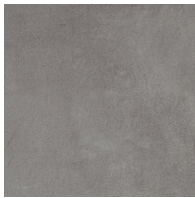
Gray VTL PLGR