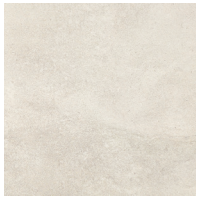
White VTL PLWH