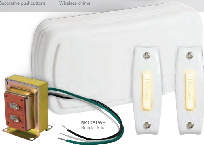
BK125LWH Builder kits

INNOVATION & QUALITY FROM THE INVENTORS OF THE MODERN DOORBELL