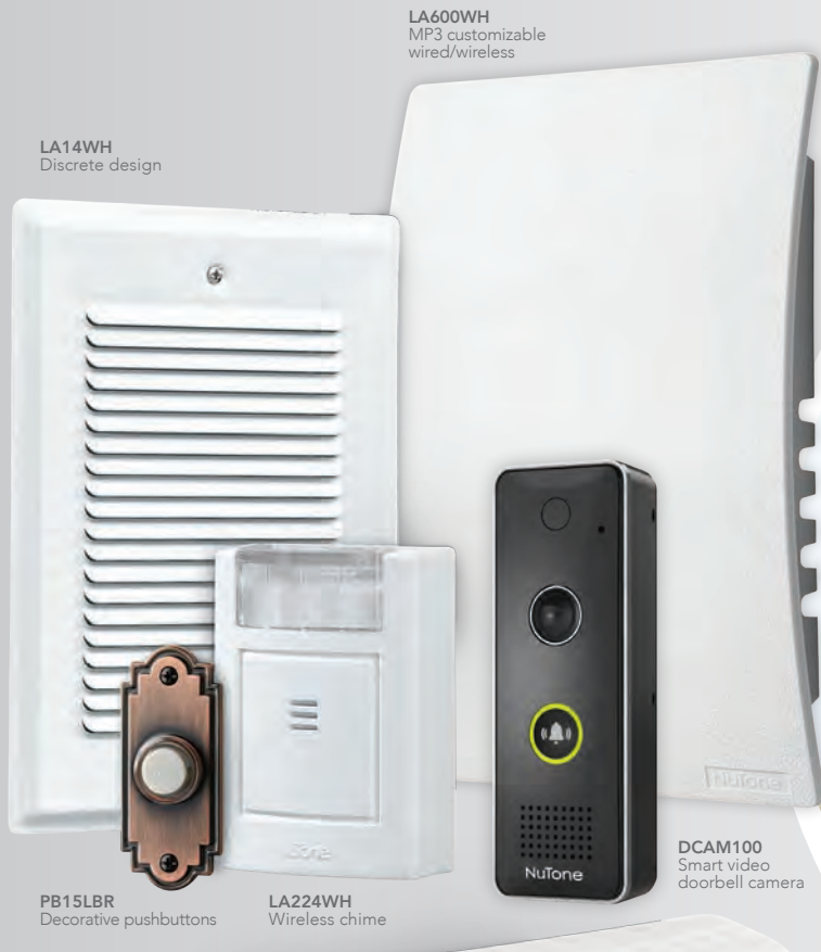
LA14WH Discrete design