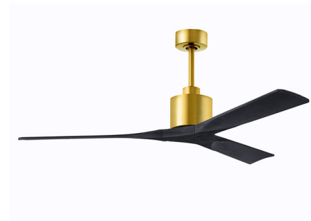
Shown in brushed brass / matte black