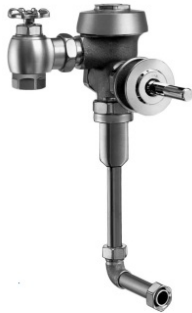
Model Royal 195 w/ Handle Shown

Consult factory for matching Sloan brand fixture options.