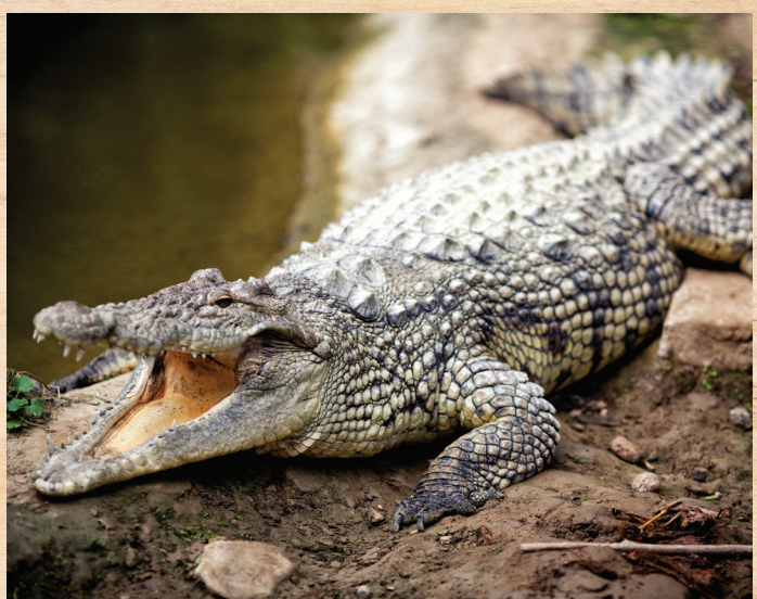
Related Words: scales, reptile, swamp, camouflage, snout, brackish