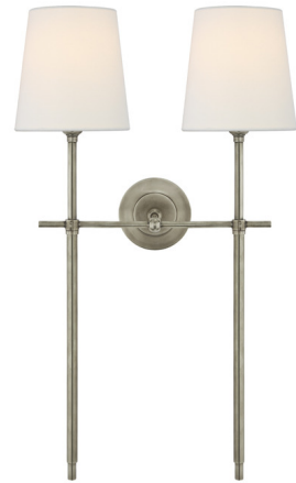
Shown in antique nickel / linen

The Bryant Tail Wall Sconce adds a clean classic look to your interior space. The smooth frame, with elongated tails, hold slim cone shaped linen or paper shades that casts warm shadows across your room.