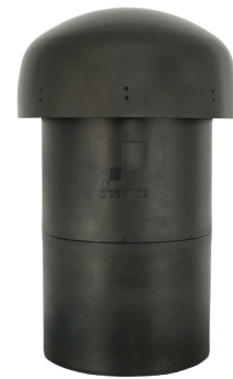
LS15T SUB (Dark Brown) SKU# 93372