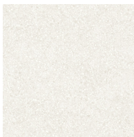
Cream VTL LGCR