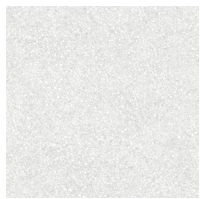
White VTL LGHW