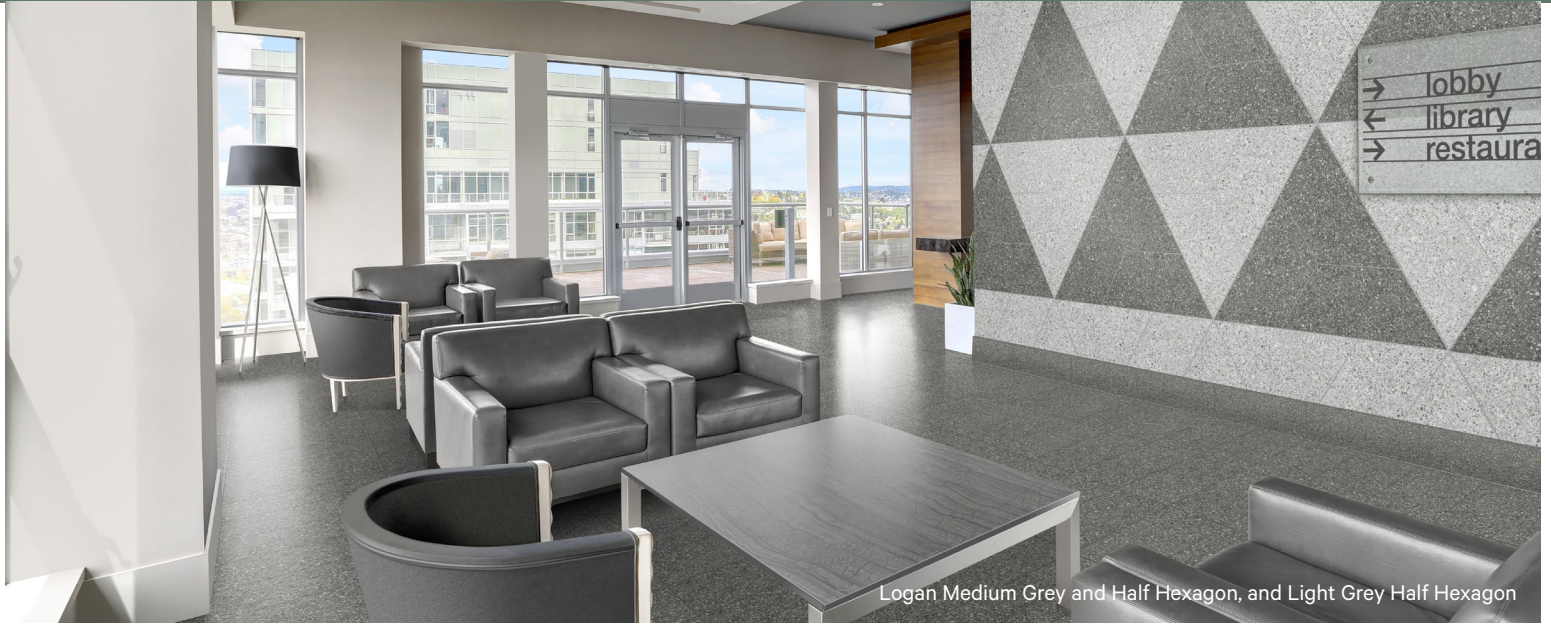
Logan Medium Grey and Half Hexagon, and Light Grey Half Hexagon