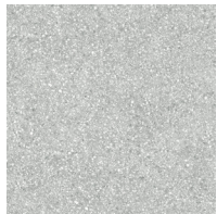
Light Grey VTL LGLG