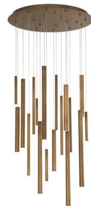
Shown in antique brass / frosted

COLOR RENDERING . . . . . 90 CRI LAMP COLOR . . . . . 3000K LUMENS/WATT . . . . . 1,530.00 LUMINOUS FLUX . . . . . 1530 lumens