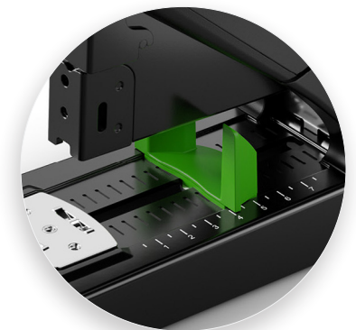
Adjustable depth guide keeps your clinches in the right spot with every stack.