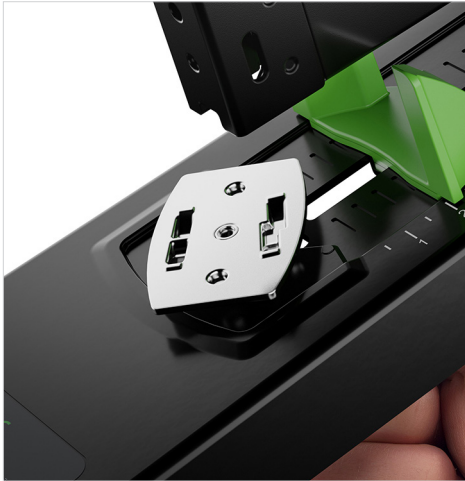
The rotating anvil offers the choice of by-pass or parallel stapling.