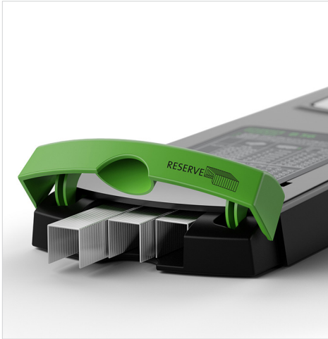
The convenient base compartment stores extra staples.