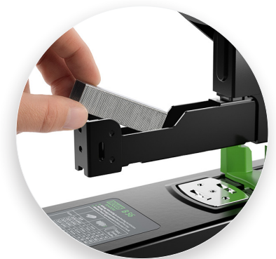
Anti-Blocking System prevents jams and the hassle of stuck documents.