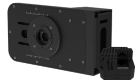
SIDEMOUNT & POE+ NETWORK ADAPTER