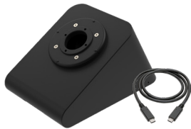
WEDGEMOUNT & CABLE