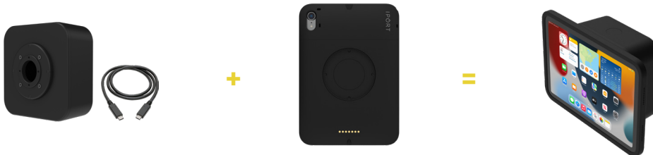
VESAMOUNT & CABLE

VesaMount ships with an IPOINT CONNECT USB-C cable so you can use iPad Power Adapter in the installation. Or, use the optional IPOINT POE+ Network Adapter and install inside the VesaMount to provide POE+ Power and 100Mbps Ethernet LAN to iPad. (Works with USB-C iPads only). VesaMount is part of IPOINT's CONNECT MOUNT line of fixed mounting accessories.