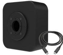
VESAMOUNT & CABLE