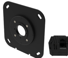
WALLMOUNT & POE+ NETWORK ADAPTER