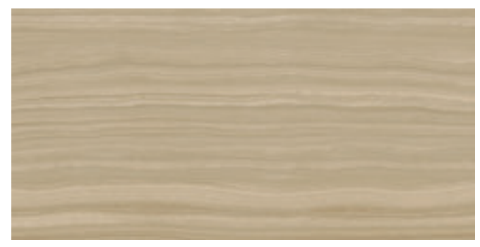
JAV02 ▶ Flat White