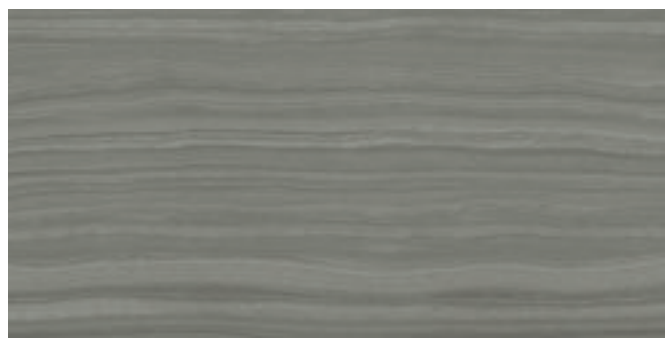
JAV05 ▶ French Press