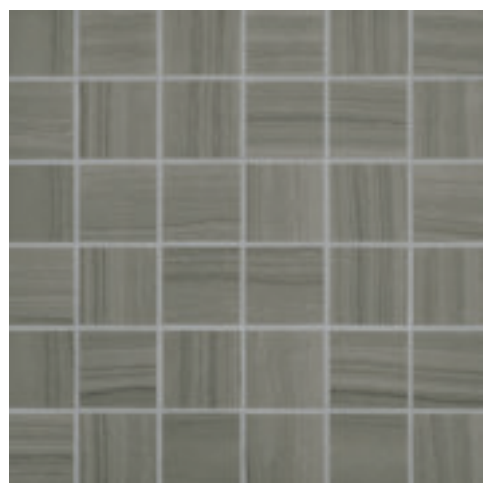
JAV05 ▶ French Press 2 x 2 Mosaics