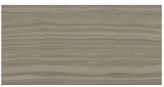
JAV04 ▶ Fresh Ground