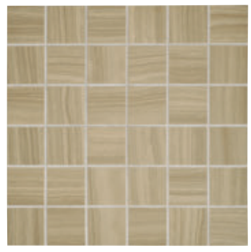
JAV02 ▶ Flat White 2 x 2 Mosaics