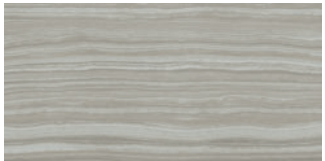
JAV03 ▶ House Blend