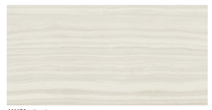
JAV01 ▶ Two Sugars