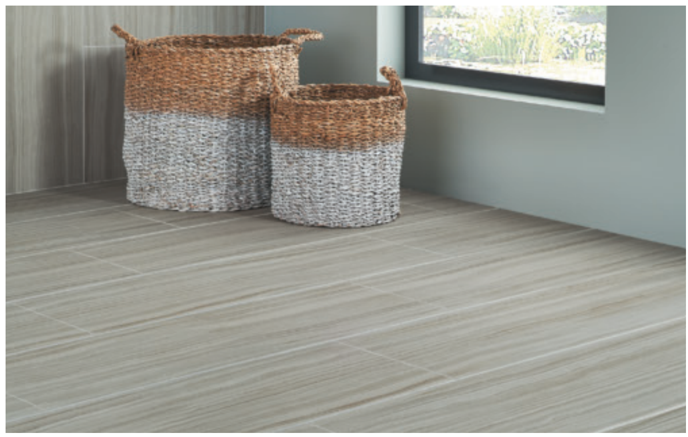
JAV03 ▶ House Blend 12 x 24

Information listed here is subject to change. Please refer to CrossvilleInc.com for the latest, most accurate information.