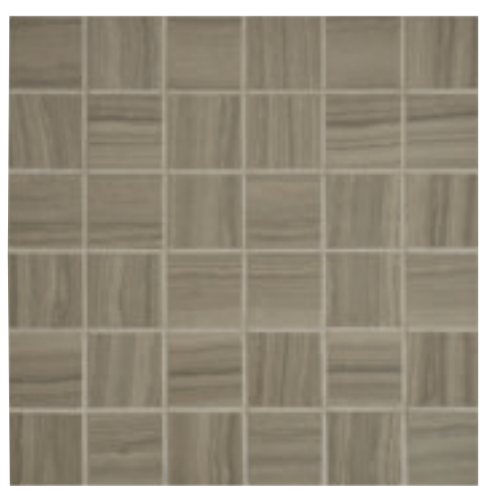
JAVO4 ▶ Fresh Ground 2 x 2 Mosaics