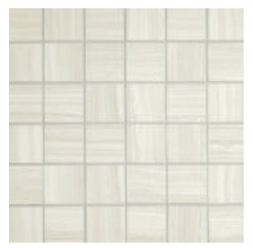
JAV01 ▶ Two Sugars 2 x 2 Mosaics