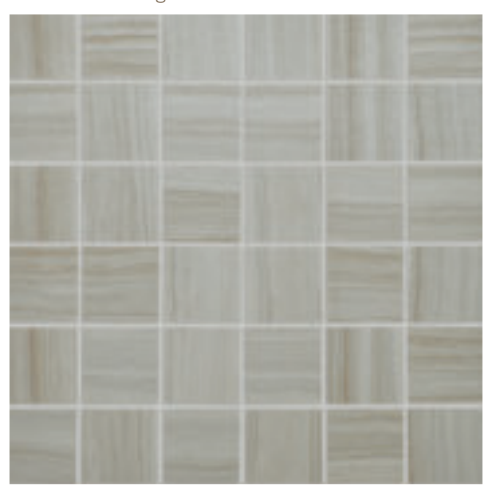
JAV03 ▶ House Blend 2 x 2 Mosaics