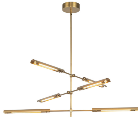
Shown in vintage brass / clear

The Astrid Multi Light Pendant features Metal shades with an Urban Bronze or Vintage Brass finish. Includes 2, 3, or 6 shades, each with an integrated LED light source and a Clear Glass lens. Bars can be twisted to provide uplighting or downlighting. ETL listed.