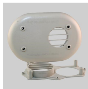
Sample DiversiTech 2 in. and 3 in. Low Profile Horizontal Vent Kit

Rinnai America Corporation • 103 International Drive, Peachtree City, GA 30269