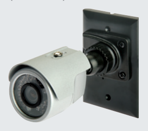
Color IR Camera (CM1029)