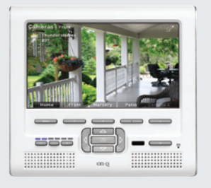
Studio LCD Console (HA500-XX)

Our newest addition to the line – the Color IR Camera – offers a color view of the home's surroundings during daylight hours while reverting to vivid black-and-white imagery in low-light situations. The unobtrusive look of the Ball Camera allows it to blend into any decor. It features in-ceiling and in-wall mounting capabilities and can be placed inside or outside the home.