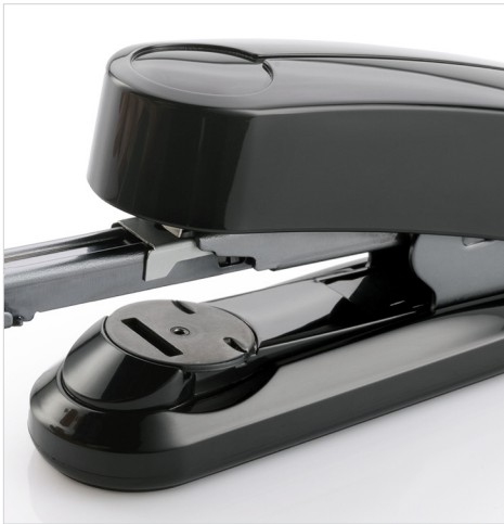
Dual staple guide provides even stapling pressure for superior performance.