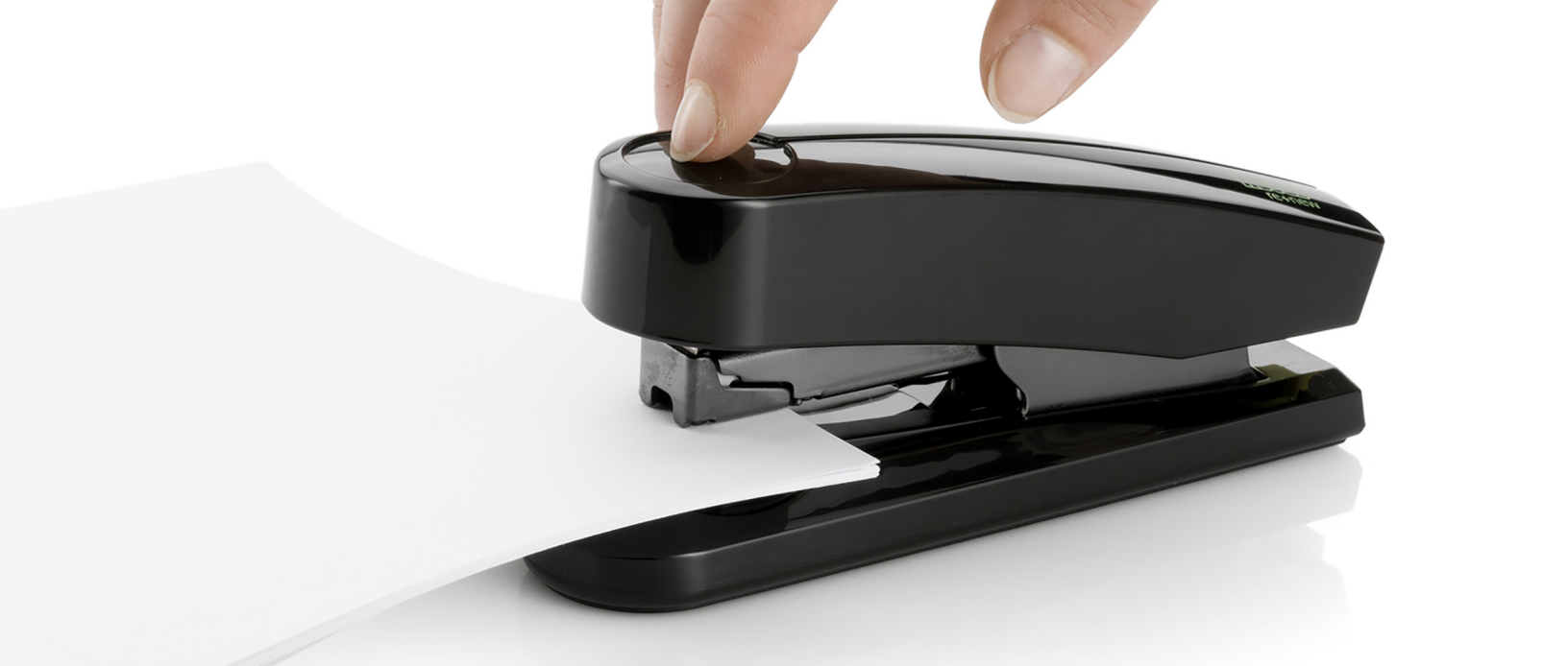
Staple legs are pressed flat to provide 30% more binder and filing storage.