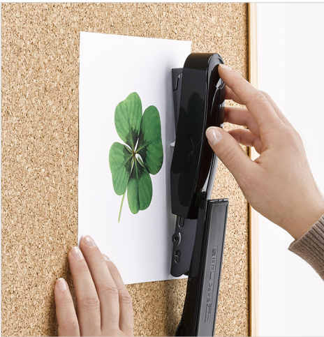
Metal internal components increase performance and durability.