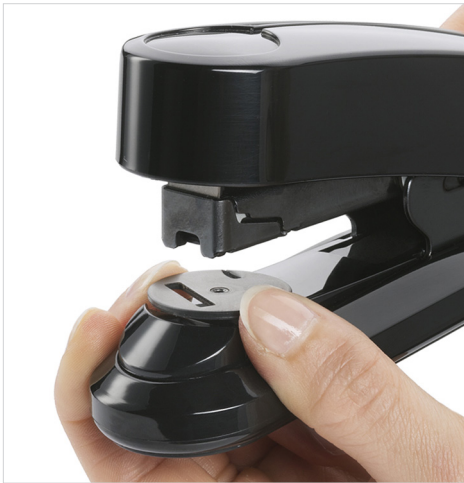
Rotating anvil for stapling, temporary pinning, or tacking.