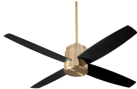
Shown in aged brass

The Oslo Ceiling Fan brings a sleek simplicity to your interior space. The 4 square-tip blades connect to a sleek cylinder motor, bringing an elevated edge to your room. Includes one 4 inch and one 6 inch downrods and a wall control. Optional light kit and remote control sold separately below. 3 speeds, reversible, has a 188x53 AC motor, 52 inch blade sweep, and 14 degree blade pitch. Measured at high it has airflow: 4991, Electric Energy Consumption: 64W, and airflow efficiency: 78 CFM/W.