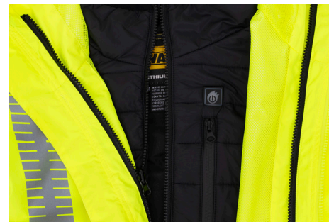
Zip in DEWALT heated puffer vest to add extra warmth