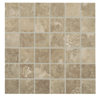
STF04.10202MOS Travertine Coffee 2 x 2 Mosaic