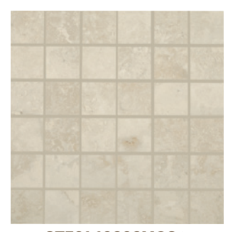
STF01.10202MOS ► Travertine Ivory 2 x 2 Mosaic