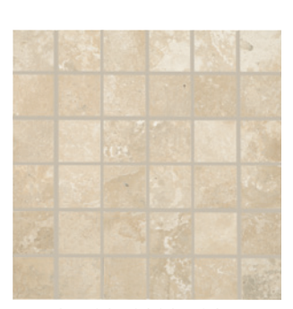
STF02.10202MOS Travertine Beige 2 x 2 Mosaic