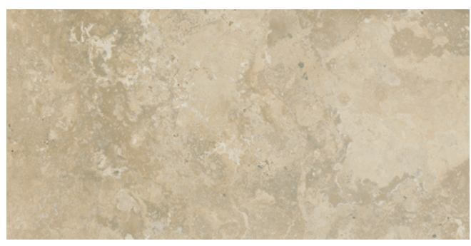
STF02 ► Travertine Beige