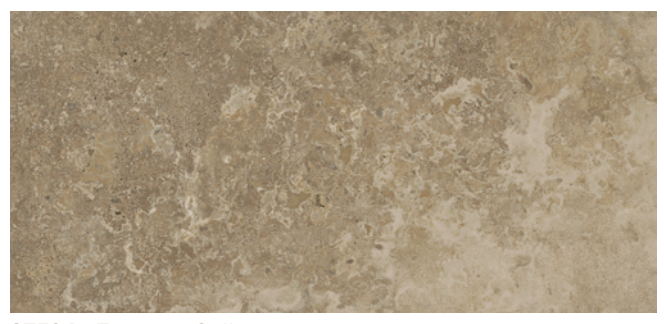
STF04 ► Travertine Coffee