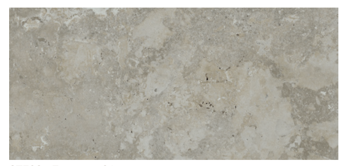
STF03 ► Travertine Silver