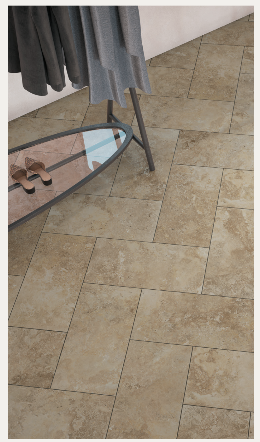
Floor: STF04 > Travertine Coffee 12 x 24 UPS