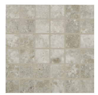
STF03.10202MOS Travertine Silver 2 x 2 Mosaic