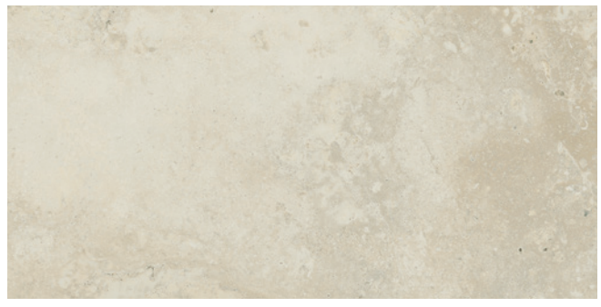
STF01 ► Travertine Ivory