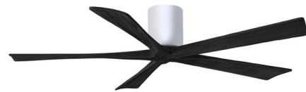
Shown in gloss white / matte black