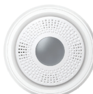
PROSIXSIREN Indoor Siren AA Lithium (4)*