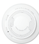
PROSIXCOV PROSIXCOVCN** Carbon Monoxide (CO) Detector CR123A (2)*