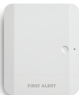
VISTA H3 VISTA H3CN Security Panel 64 Zones, IP, RFSIX