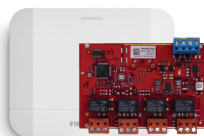
VISTA H RELAY Relay Module