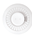
PROSIXHEATV Heat Sensor CR123A (2)*