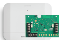
VISTAHTKVR-B ECP to IB2 HW/5800/Relays Takeover Expansion Module