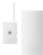
PROSIXFLOOD Flood Detector CR123A (1)*