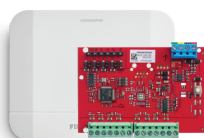
VISTAHEXPHW HW Expansion Module