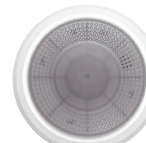
PROSIXSIRENO Outdoor Siren AA Lithium (4)*