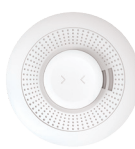
PROSIXSMOKEV Smoke Detector CR123A (2)*