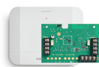
VISTAHTKVR-V HW V-Plex Takeover Module