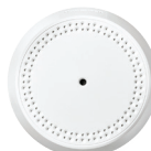
PROSIXGB Glassbreak Detector CR123A (1)*