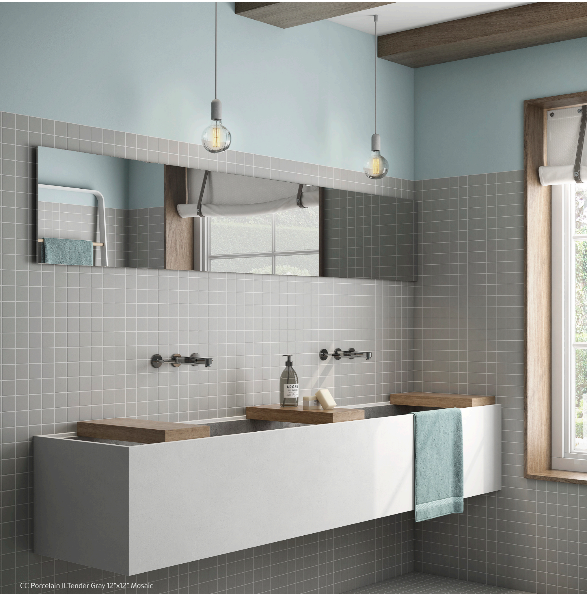
CC Porcelain II Tender Gray 12"x12" Mosaic

CC Porcelain II is a sober unglazed porcelain mosaic. Available in 4 neutral tones, which can be used in both commercial and residential projects.