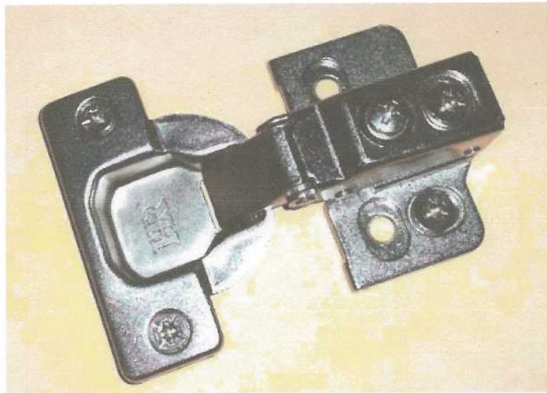
HINGE P/N 22855-9SFT

This report serves to document the testing of the above sample to all applicable hinge test paragraphs of ANSI/BHMA A156.9-2015, American national standards for cabinet hardware, and ANSI/KCMA A161.1-2012, American national standards for kitchen and vanity cabinets. Test procedures include a hinge permanent set test, hinge operating life test, closing force test, self closing test, and an over opening test. The remainder of this report will show how the hinge samples submitted for testing met all of the requirements needed for conformance to the two test standards.