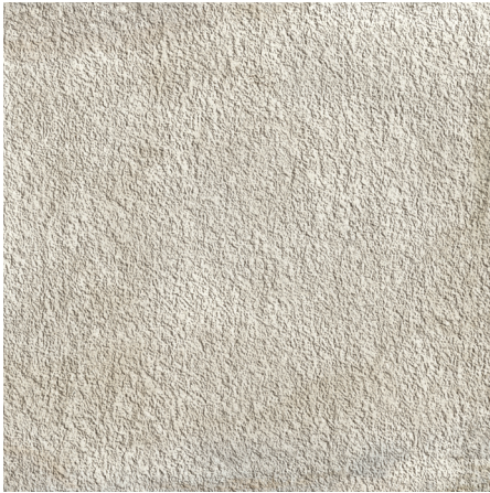
White Bush Hammered