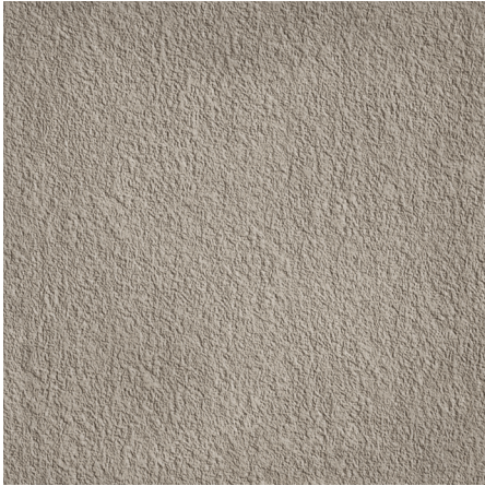
Beige Bush Hammered