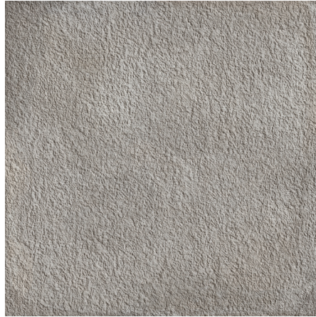
Gray Bush Hammered