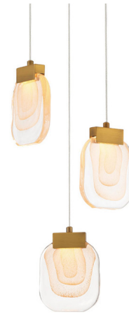
Shown in gold / clear

COLOR RENDERING . . . . . 90 CRI LAMP COLOR . . . . . 3000K LUMENS/WATT . . . . . 132.00 LUMINOUS FLUX . . . . . 660 lumens