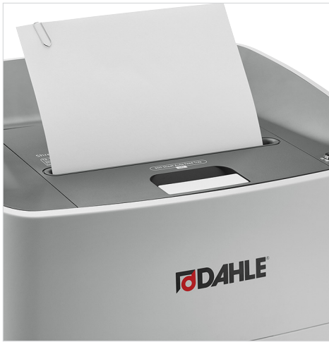
Use the manual feed for quick shredding of a few sheets at a time.

Quickly and easily shred up to 14 sheets in the manual feed opening or stack up to 300 sheets in the auto-feed tray.