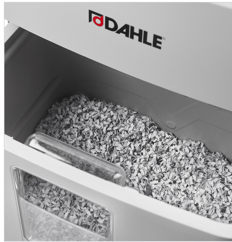
Easy-to-empty waste bin features a clear window for viewing shred level.