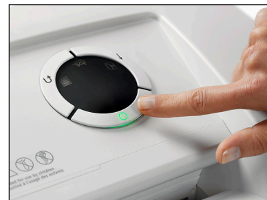
The command dial controls power up, reverse, and continuous run functions.