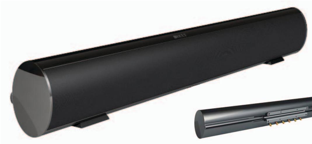
HTF 8003 Front Speaker