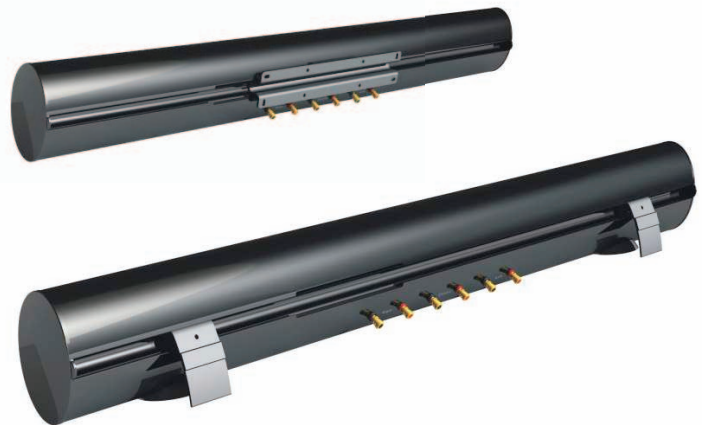
HTF 8003 Front Speaker – rear view