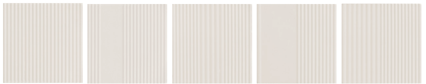
Ivory VTL TTIV 66

4 x 5 Hex comes in four unique patters that are pre-boxed in a random assortment