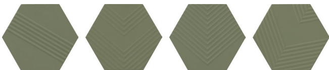
Green VTL TTGR HEX4

6 x 6 comes in five unique patters that are pre-boxed in a random assortment