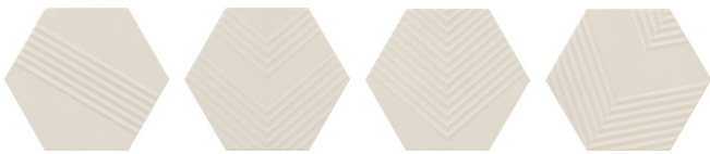
White VTL TTWH HEX4

4 x 5 Hex comes in four unique patters that are pre-boxed in a random assortment