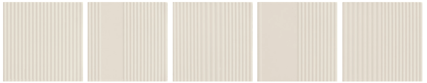
White VTL TTWH 66

4 x 5 Hex comes in four unique patters that are pre-boxed in a random assortment