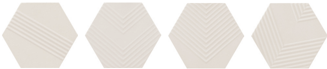
Ivory VTL TTIV HEX4

6 x 6 comes in five unique patters that are pre-boxed in a random assortment