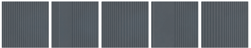
Blue VTL TTBL 66

4 x 5 Hex comes in four unique patters that are pre-boxed in a random assortment