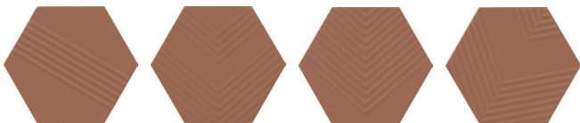
Red VTL TTRD HEX4

6 x 6 comes in five unique patters that are pre-boxed in a random assortment