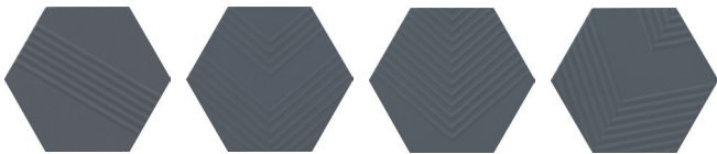
Blue VTL TTBL HEX4

6 x 6 comes in five unique patters that are pre-boxed in a random assortment