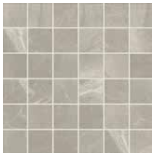
LIGHT GRAY ME08