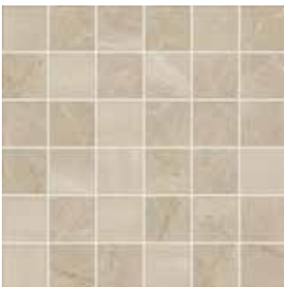
COOL BEIGE ME07