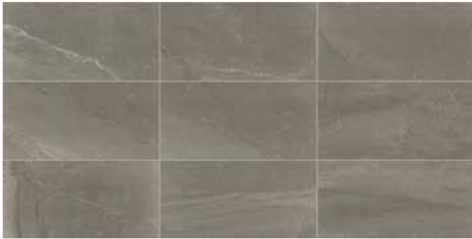
DARK GRAY ME09