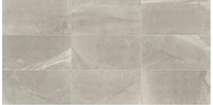
LIGHT GRAY ME08