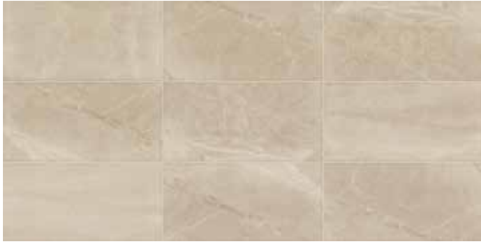
COOL BEIGE ME07