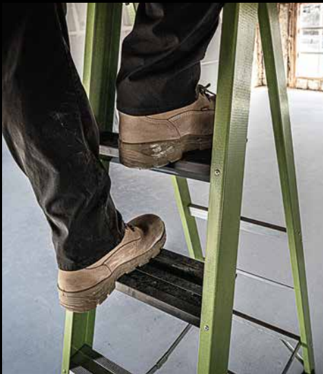
Extra-Wide Comfort Steps