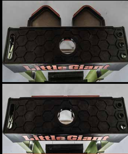
Rotating Wall Pad