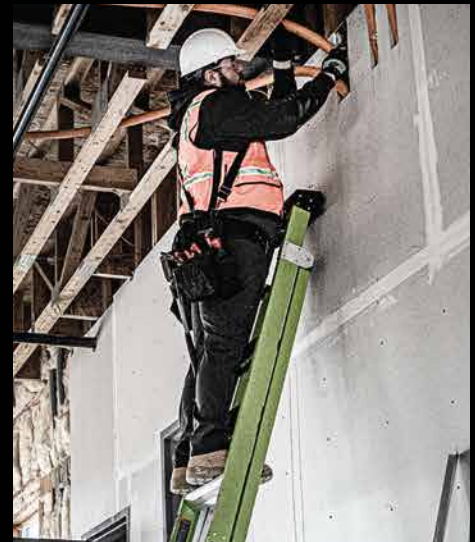
Leans Against Walls