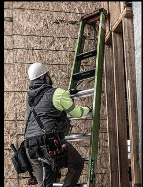
Leans on Inside Corners