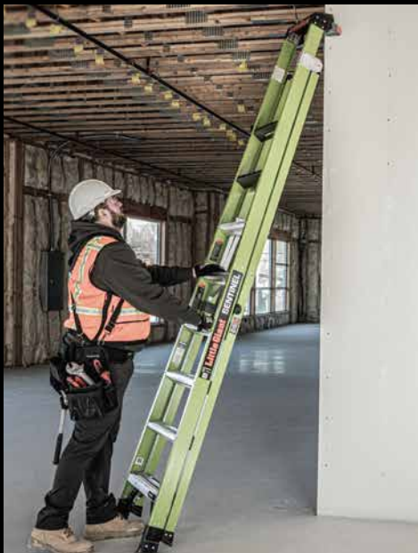
Leans on Outside Corners