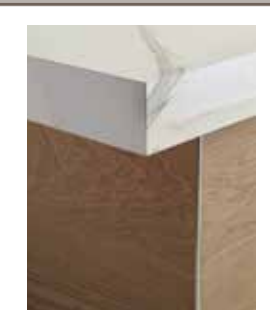
5.6mm Field Applied Bullnose