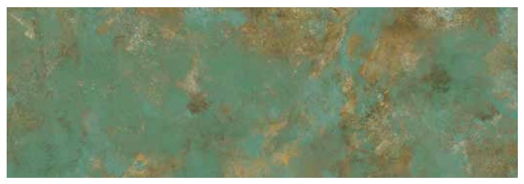
Verderame - L9960 5.6 Stocking