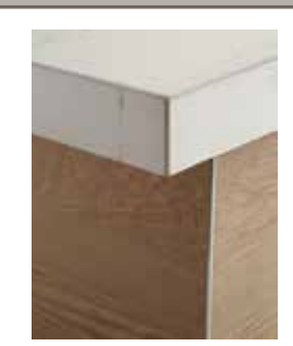
5.6mm Back Mitered and Epoxied