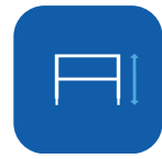
Minimum/Maximum Bed Deck Height ▼