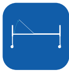
Maximum Back Angle ▼