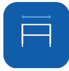
Bed Deck Width ▼