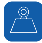
Product Weight ▼