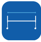
Overall Length (incl. head/foot boards) ▼