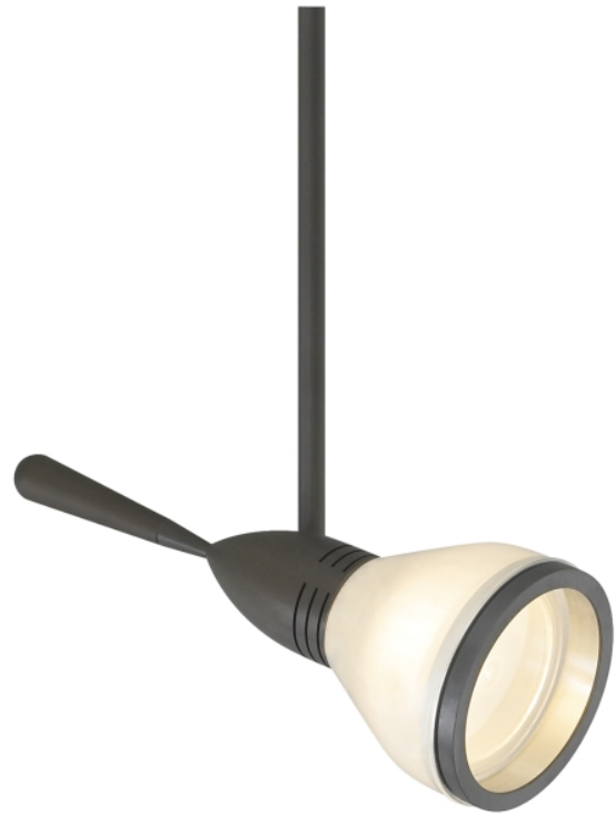
Antique Bronze With Round Glass Shield Accessory