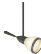
Antique Bronze With Round Glass Shield Accessory