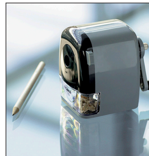
Mounting is not necessary which allows for easy placement and portability.