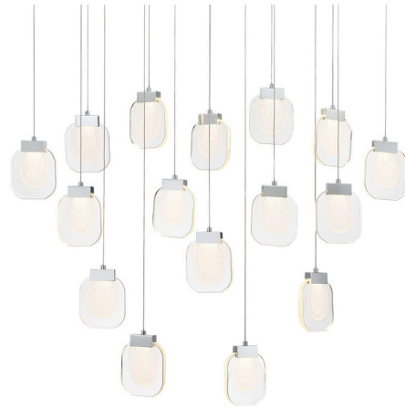
Shown in chrome / clear

COLOR RENDERING . . . . . 90 CRI LAMP COLOR . . . . . 3000K LUMENS/WATT . . . . . 640.00 LUMINOUS FLUX . . . . . 3200 lumens