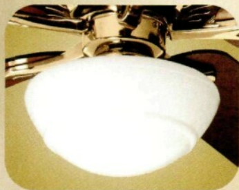
Contemporary Schoolhouse Globe (Fitter Sold Separately) 22565