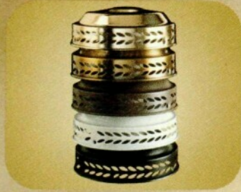
Globe Adaptor Kits for adding globes (100 watt maximum)