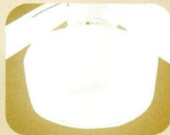
Opal Schoolhouse Globe (Fitter Sold Separately) 8" 22515 10" 22555