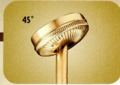
Vaulted Ceiling Mount