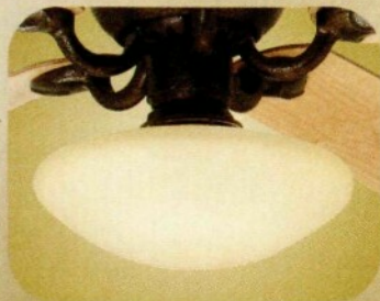
Cedonia™ Rustic Seeded Globe (Fitter Sold Separately) 22575