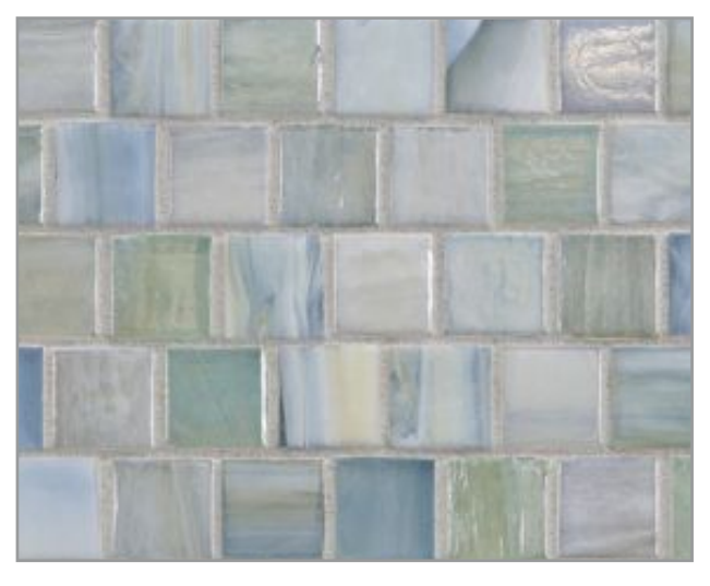
1 x 1 Offset (25 mm x 25 mm)