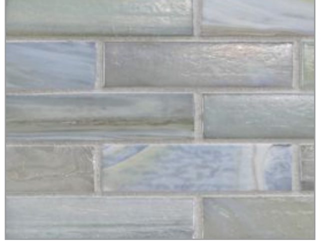
1 x 4 Brick (25 mm x 100 mm)