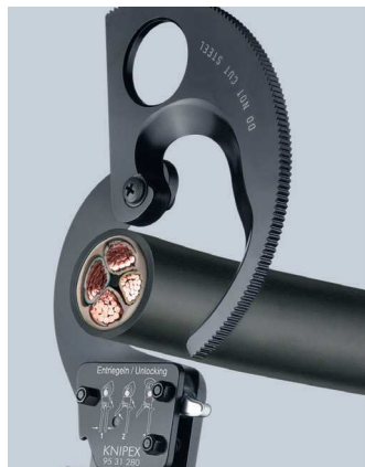
95 31 280: Large cutting capacity: max. 2" (52 mm) dia. / 380 mm 2