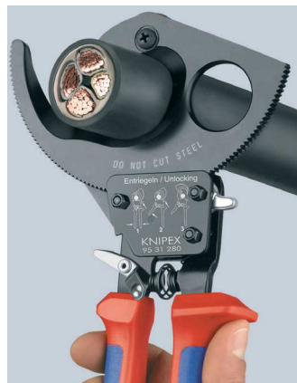
Ratchet principle and two-stage ratchet drive for easier cutting