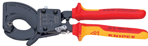
95 36 250 SBA