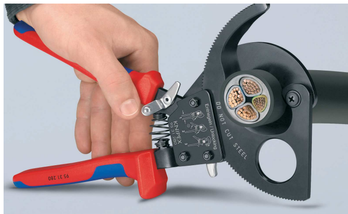
95 31 250/280: Fixed handle with support area as an aid to position the pliers when cutting