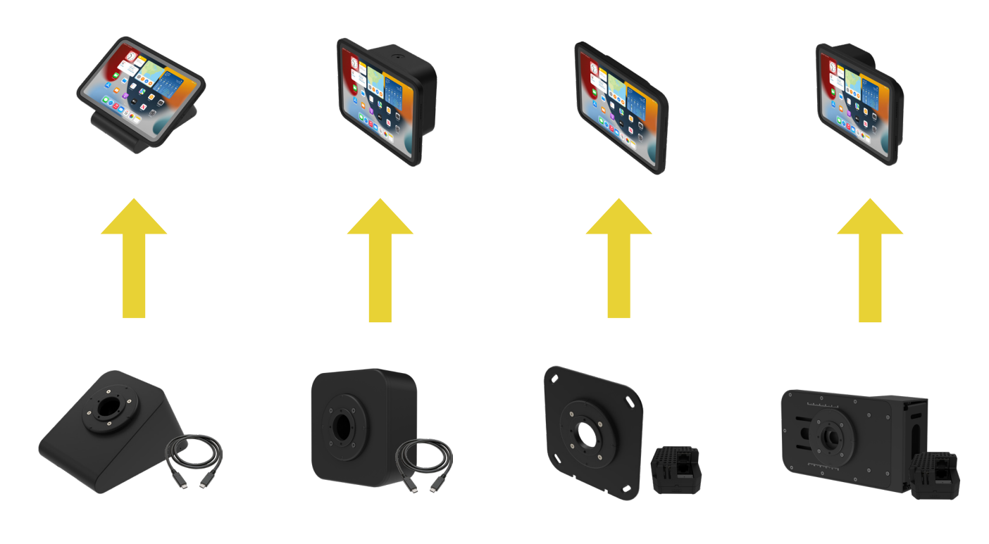
WEDGEMOUNT & CABLE

Choose from four different mounts for nearly any installation scenario. All CONNECT Mounts work with CONNECT Case, creating a minimalist and functional CONNECT MOUNT system.