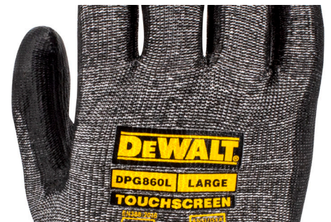
Nylon HPPE with fiberglass for great cut resistance