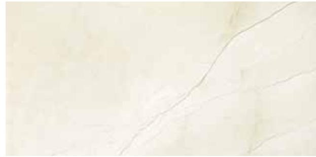
18 x 36 in / 45.7 x 91.4 cm Honed 5000-0370-0