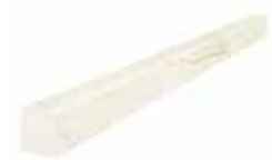
1/2 x 12 in / 1.3 x 30.5 cm Deco-Bar Honed 5002-0132-0