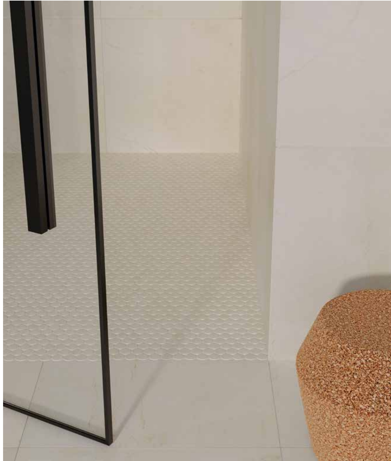
1.25 in / 3 cm Avorio Crema Penny Round Honed Marble Mosaic