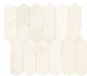
2 x 6 in / 4.9 x 15 cm Picket Mosaic Honed 5001-0259-0