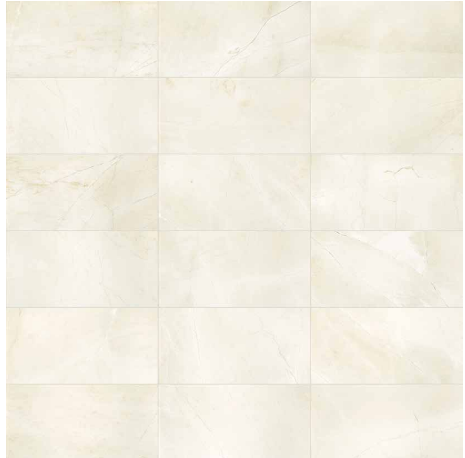
18 x 36 in / 45.7 x 91.4 cm tile variations

The inherent beauty of natural stone products is expressed through variations in color, texture, shading and veining.