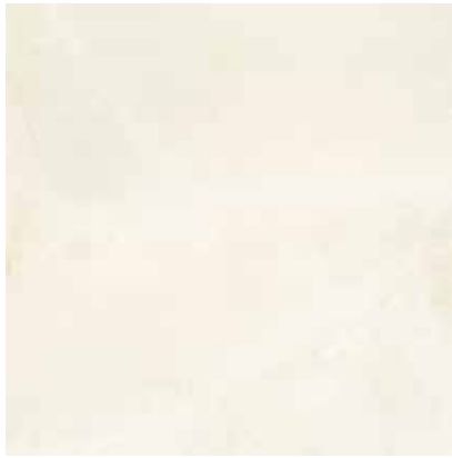
24 x 24 in / 61 x 61 cm Honed 5000-0371-0