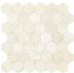
2 in / 4.9 cm Hexagon Mosaic Honed 5001-0257-0