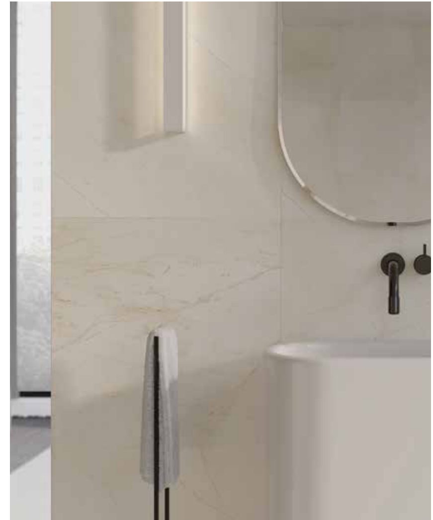
24 x 24 in / 61 x 61 cm Avorio Crema Honed Marble Tile