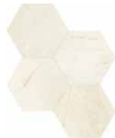
6 in / 15 cm Hexagon Mosaic Honed 5001-0260-0