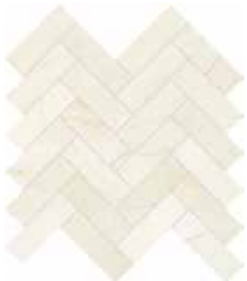
1.25 x 4 in / 3.3 x 10 cm Herringbone Mosaic Honed 5001-0258-0