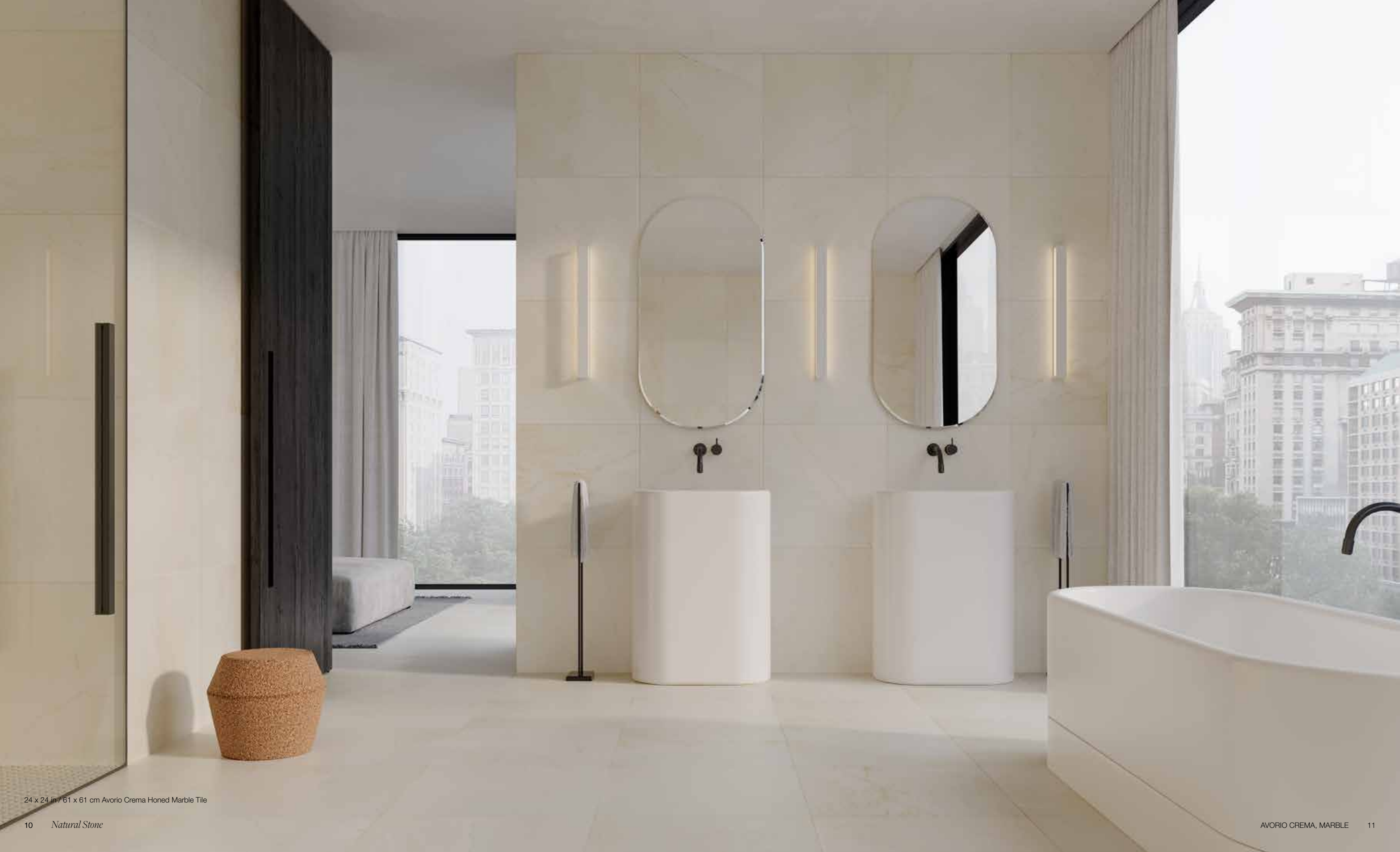
24 x 24 in / 61 x 61 cm Avorio Crema Honed Marble Tile