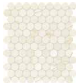
1.25 in / 3 cm Penny Round Mosaic Honed 5001-0261-0