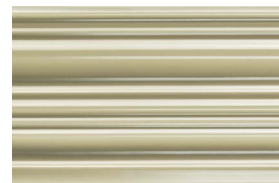
60359/CR4x6 & 60359/CRS4x1.5 Chair Rail & Chair Rail Stop (not shown)