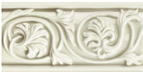
60302/L3x6 Floral Listello