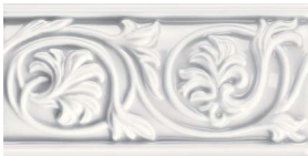
60301/L3x6 Floral Listello