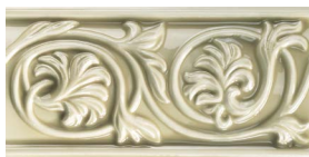
60359/L3x6 Floral Listello