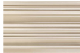
60325/CR4x6 & 60325/CRS4x1.5 Chair Rail & Chair Rail Stop (not shown)