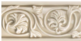
60325/L3x6 Floral Listello