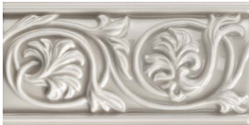
60312/L3x6 Floral Listello