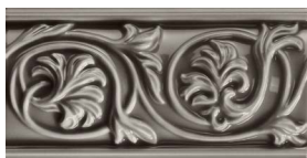
60366/L3x6 Floral Listello