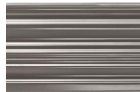
60366/CR4x6 & 60366/CRS4x1.5 Chair Rail & Chair Rail Stop (not shown)