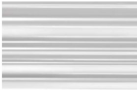
60301/CR4x6 & 60301/CRS4x1.5 Chair Rail & Chair Rail Stop (not shown)