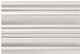
60312/CR4x6 & 60312/CRS4x1.5 Chair Rail & Chair Rail Stop (not shown)