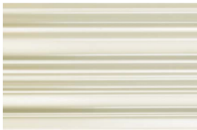
60302/CR4x6 & 60302/CRS4x1.5 Chair Rail & Chair Rail Stop (not shown)