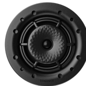
VXXT8R SKU 93735 PAIR