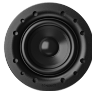
VXXT8RW SKU 93736 EACH