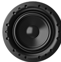
VXXT10RW SKU 93737 EACH