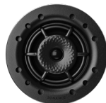
VXXT6R SST SKU 93733 EACH