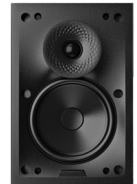
VXXT6 SKU 93734 PAIR