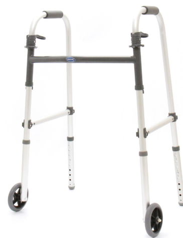
6291-5F: Dual-Release Adult Paddle Walker with 5" Wheels

The Invacare® Heavy-Duty Dual-Release Paddle Walker is strong, stable and simple to use, designed to help individuals to walk with confidence and ease. This walker also is compatible with Invacare leg accessories.