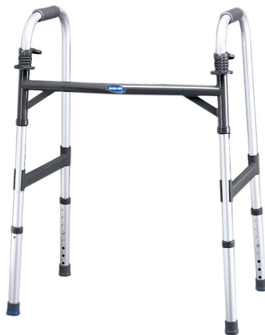
6291-HDA: Heavy-Duty Dual-Release Adult Walker